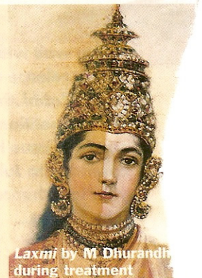
Laxmi by M Dhurandh during treatment

If you collect art with a heart, and can't bear to see your objects fading with the vicissitudes of time, you can now safely check restoration possibilities with Dharohar, an art conservation centre. Formed by two individuals, Venkat and Madhavi, in Lucknow, the centre provides a range of restoration services. You can restore old ceramic pieces, murals, metal, oil, watercolour, miniature, Tanjore, picchwai and thanka paintings. You can also salvage material on paper; like old manuscripts, printed books, lithographs, oileographs, and photographs. And for those of you who live in havelis , take heart! They also work with stone, wooden sculpture and icons, and old textiles! Services are offered at the centre, or at the site. For more information, write to Dharohar, 30, Ravindra Garden, Aliganj, Lucknow 226 024, or call at (522) 335 492, 98380 33210, or e-mail them at dharohar99@hotmail.com